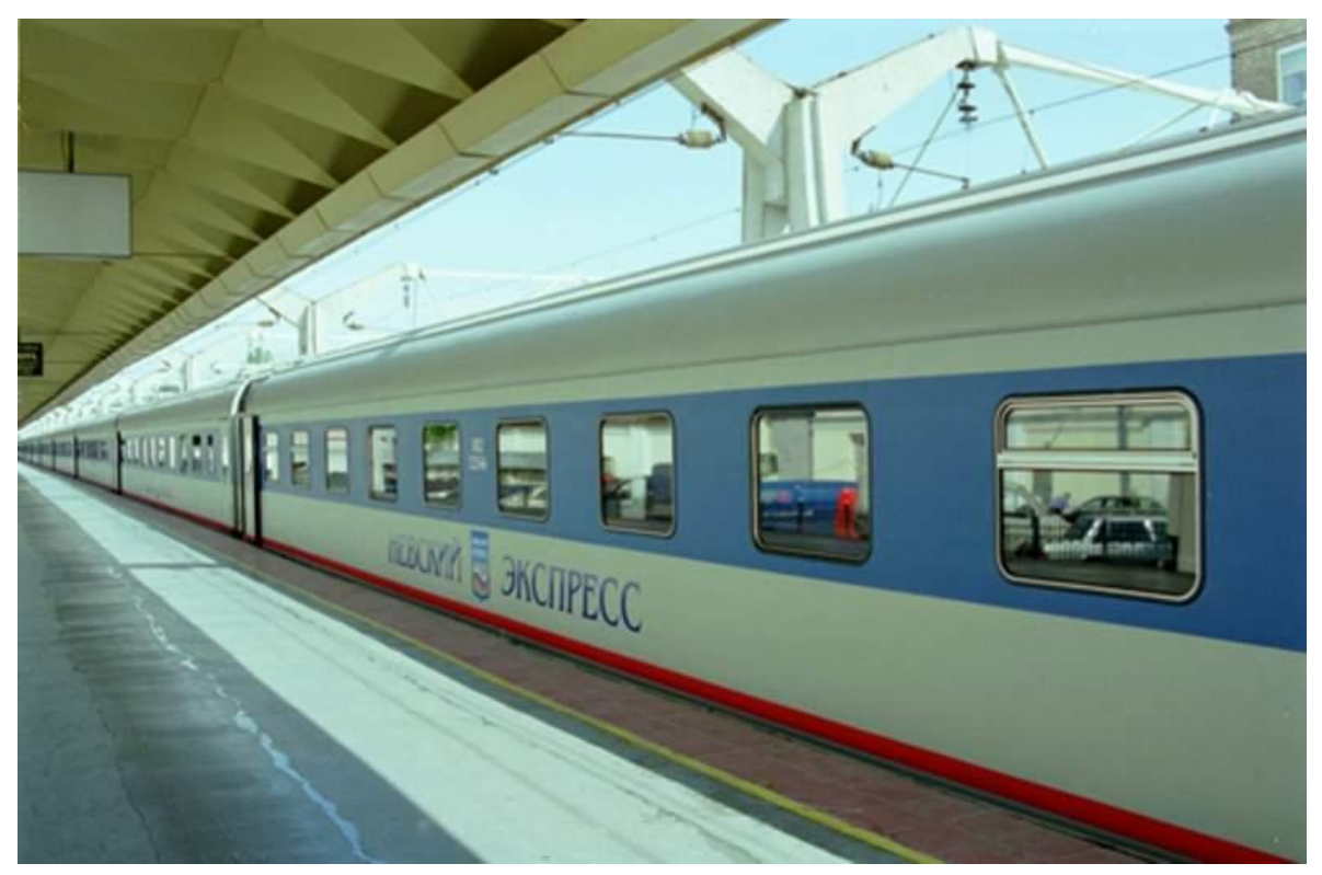
Under the contract, Transmashholding-Hungary will deliver 1,300 sitting passenger cars to ENR.

The Transmashholding-Hungary consortium has secured a contract worth more than €1bn ($1.17bn) to supply passenger car trains to Egyptian National Railways (ENR).