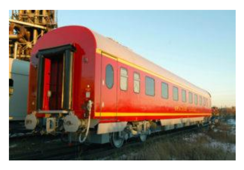
Passenger car manufactured by Transmashholding

Egyptian National Railways, which is managed by the Egyptian Railway Authority, has signed a contract with the Russian-Hungarian consortium Transmashholding-Hungary Kft. for the supply of 1,300 passenger cars. The contract has a runtime of five years from the date of signing.